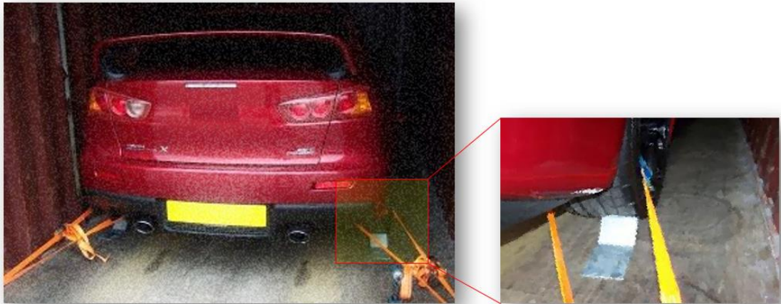
Figure 1.0: Securing the test vehicle